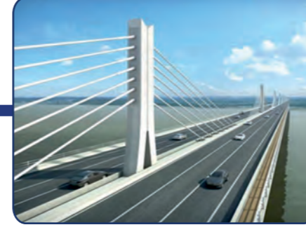
India: Phaphamau Bridge over River Ganga (6 lane, 3.839Km - Extradosed) Scope: Feasibility Study, Detailed Design & Construction Supervision