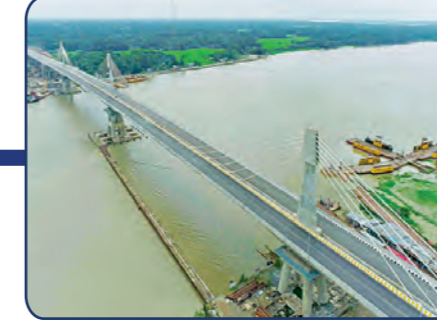
Bangladesh: Paira Bridge (4 Lane, 1.47Km - Extradosed), KFAED funded Scope: Detailed Design, Bid Management & Construction Supervision