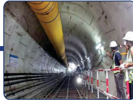
India: Mumbai Metro Line-3, Underground Corridor (UGC-03)(Total Length - 7.57Km TBM Tunnel) Scope: Detailed Design & Design Support during Construction