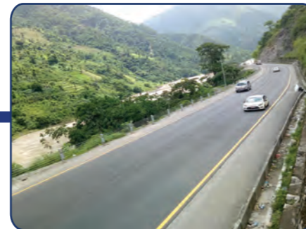
Nepal: Detailed Design of Improvement of Kathmandu Naubise Mugling Road and Bridges Length 121.50Km World Bank Funded