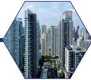
Building and Architecture