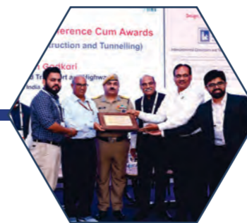
Assocham Award for Design & Project Management Consultancy for Bundelkhand Expressway, 2023