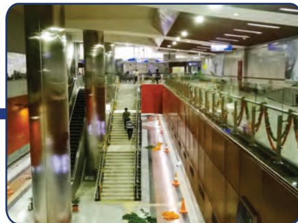
India: Janpath & Mandi House Metro Stations (CC01) Scope: Detailed Design