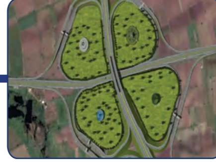
India: Vadodara-Mumbai Expressway (8 Lane, 473Km) including Tunnel, Length (4.16Km) Scope: Feasibility Study, Preliminary Design & Detailed Design