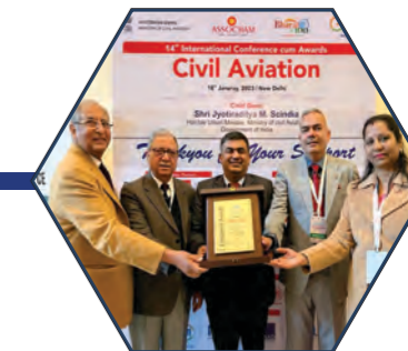
Assocham Award for Leading PMC and Engineering Consultants for Airports, 2023