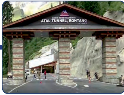
India: Atal (Rohtang) Tunnel, Length - 9.02Km World's longest Single Tube Bi-directional Tunnel at an altitude of 3000m above MSL Scope: Construction Supervision