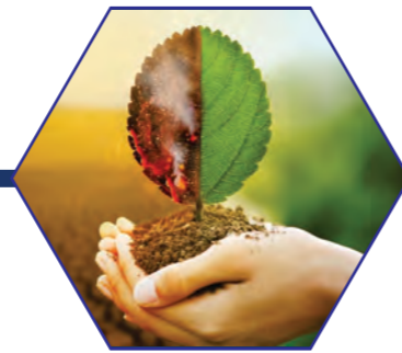
Environmental and Social Sciences