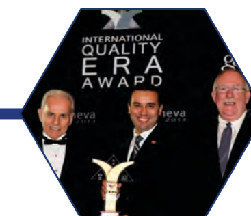
ERA Award Diamond Category Geneva, 2013