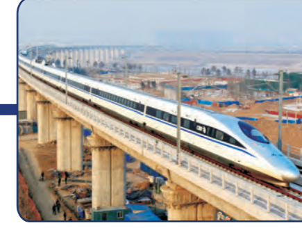
India: High Speed Rail Corridor (New Delhi - Kolkata) (Length: 1474.48Km) Scope: Feasibility Study/Preliminary Design