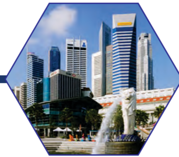
Urban Regional Planning and Smart City Solutions