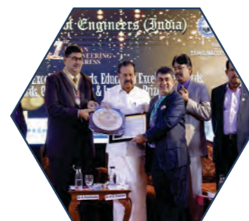
IEI Industry Excellence Award in the category of 'Engineering Services and Consultancy', 2022