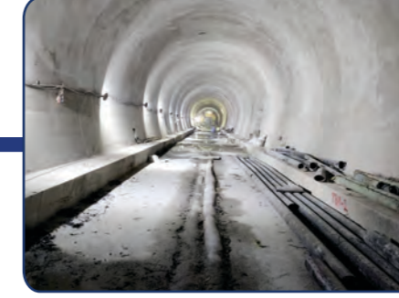
India: Rail link between Rishikesh & Karanprayag (Package 2 & 5) (Length: 25.06 Km) Scope: Detailed Design & Project Management