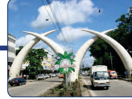
Kenya: Integrated Strategic Urban Development Plans for Cluster 1 Mombasa Town, World Bank funded Scope: Integrated Strategic Urban Development Planning & Capital Investment Planning