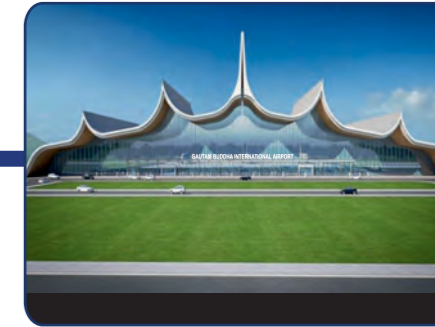
Nepal: Terminal Building (T2) of GBAUP at Bhairahawa Scope: Detailed Design & Construction Supervision