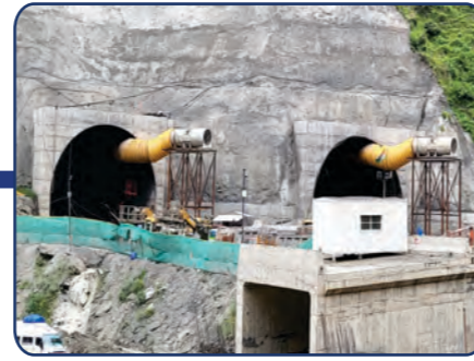
India: NH-44, Ramban Banihal Section (Total Length - 15.976Km) Scope: Feasibility Study, Detailed Design & Construction Supervision