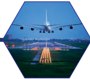
Airports and Aviation System