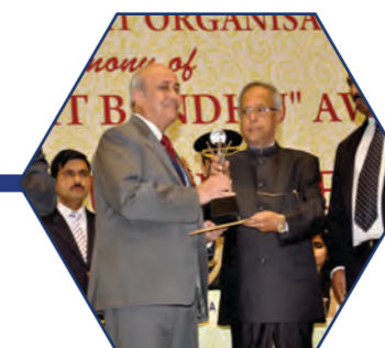
Niryat Shree Award for Outstanding Performance in Consultancy Services during 2009-2010