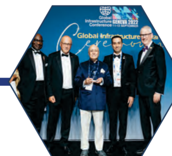
FIDIC Projects Award 2022 for Atal Tunnel in the Category 'Highly Commended for Transportation - Tunnel', 2022