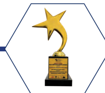
ICT received the 'Best Employer Brand Award 2022' by the HR Professional