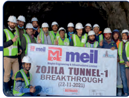
India: Zojila Tunnel (Length - 13.145Km) Asia's longest Single Tube Bi-Directional Tunnel at an altitude of 11578m above MSL Scope: Authority Engineer for Construction Supervision