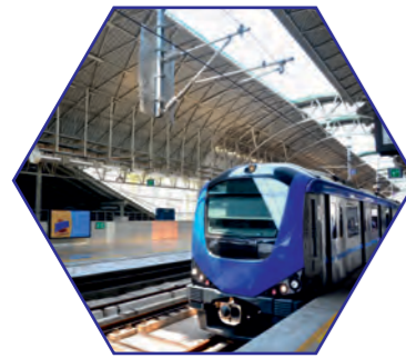
Railways and Metro Rails