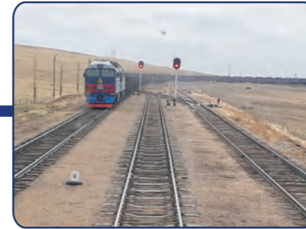
Mongolia: Bogd Khan Railway Bypass Investment Program - 01 (Length: 166.44Km, including 3 Tunnels of Length 15.16Km), ADB funded Scope: Alignment Study