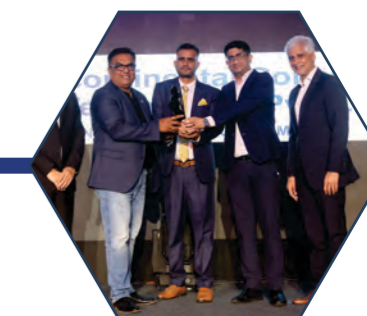
Autodesk Imagine Award in the field of Architecture, Engineering & Construction and 'Design Innovation in Building' for Mumbai Metro Line 3, 2022