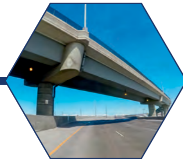
Bridges and Other Structures