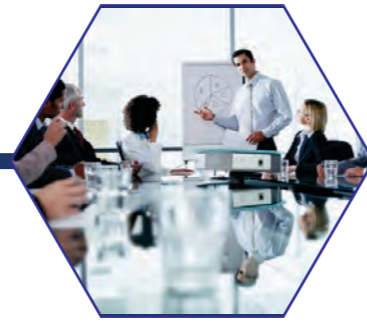
Institutional Strengthening and Capacity Building