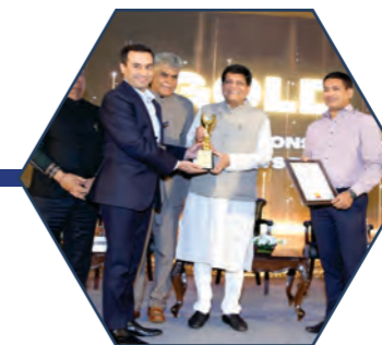
Niryat Shree Award for Outstanding Export Service Provider, 2023