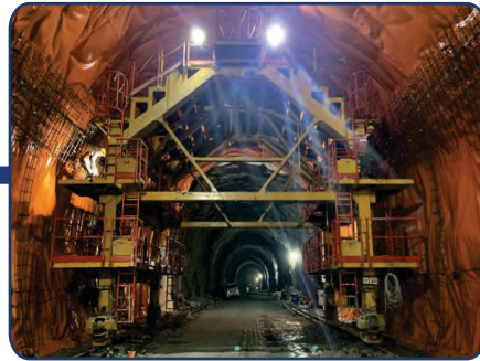
India: Z-Morh Tunnel (Length - 6.412Km) Single Tube Bi-Directional Scope: Independent Engineer for Construction Supervision