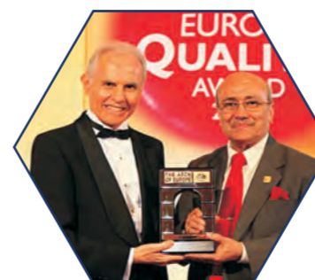
The Arch of Europe for Quality and Technology in Gold Category, 2011