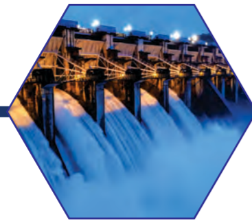
Water Resources and Public Health Engineering