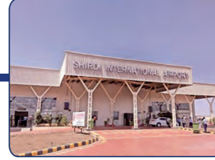
India: Shirdi Airport Scope: Project Management Consultancy