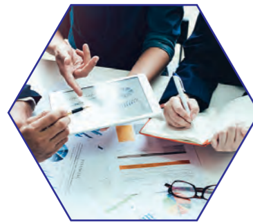
Transaction and Project Finance