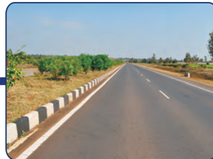
India: Consultancy Services for Detailed Project Report cum Transaction Advisory Services for Karnataka State Highway Improvement Project -III (KSHIP-III) - Group II, funded by ADB