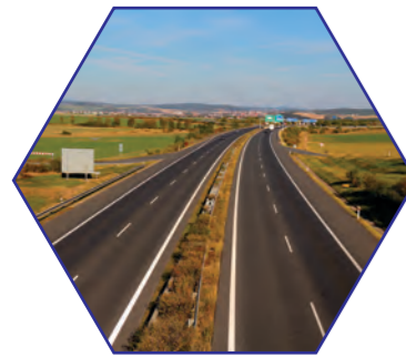
Expressways and Highways