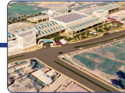
India: Bhuj and Rajkot Railway Station Scope: Authority Engineer for Construction Supervision