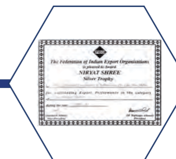
Niryat Shree Award and Silver Trophy for Outstanding Export Performance in Consultancy Services during 2000-2001