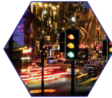
Traffic Transportation and Road Safety